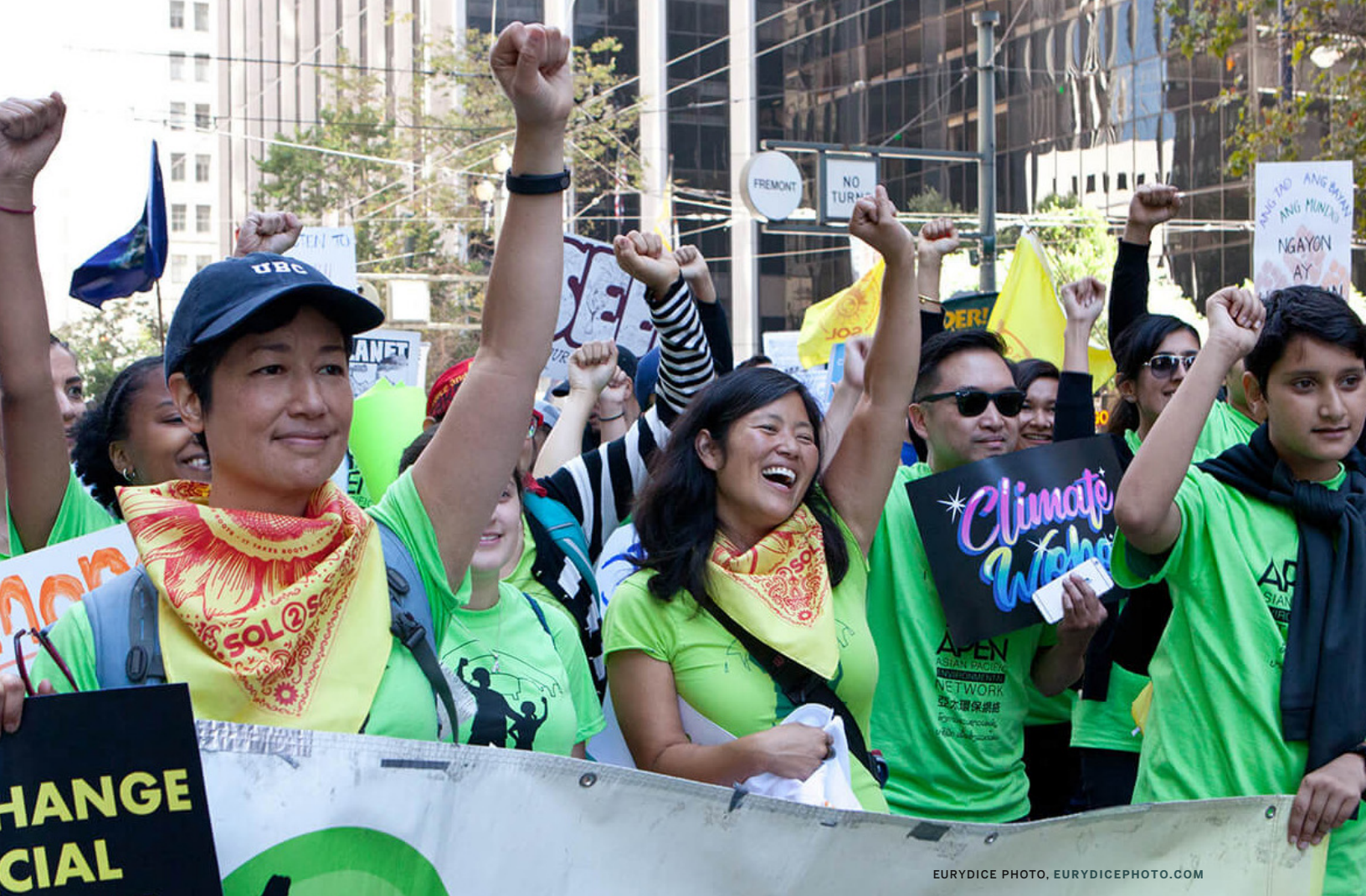
ABOVE Asian Pacific Environmental Network activists at the Rise for Climate, Jobs, and Justice march in San Francisco