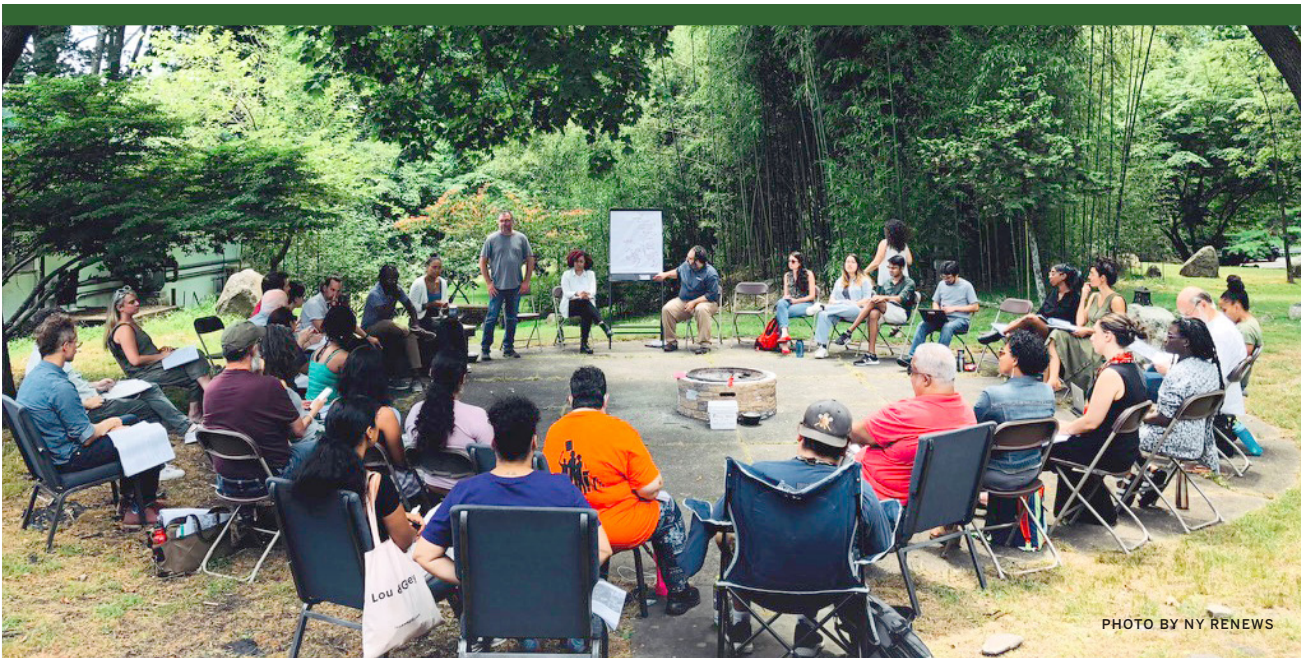
ABOVE NY Renews Steering Committee planning for 2023 at its summer retreat

Nimble and connected, intermediaries can respond in real time to emergent challenges and opportunities.